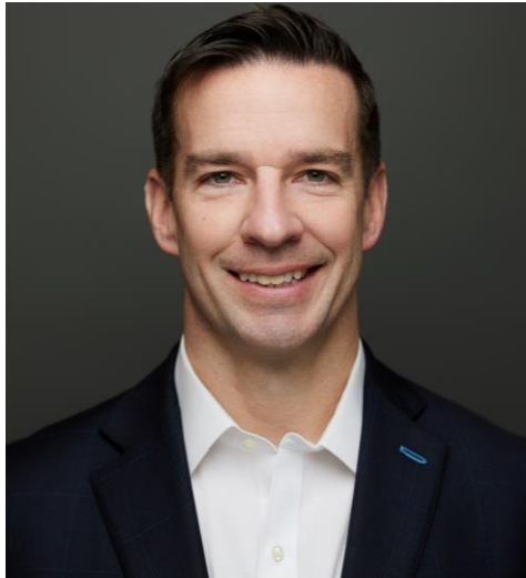
Lincoln Property Company