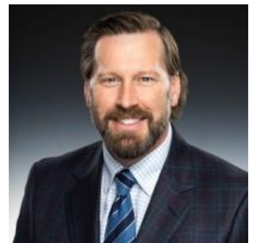
Lee & Associates